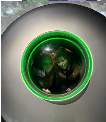
Y5 Jodrell Bank