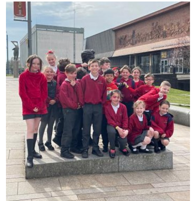
Y4 Potteries Museum