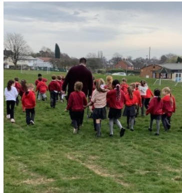
Y2 How big was the Titanic?