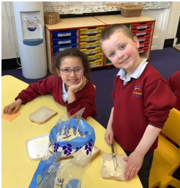
Sandwich making in Year 1 DT