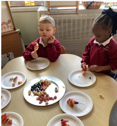
Fruit Kebabs in Early Years!