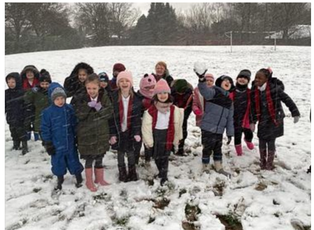
Fun in the snow!