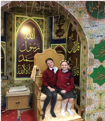
Year 6 Mosque visit