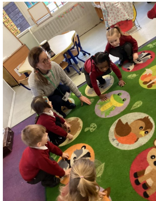
Specialist music in Nursery