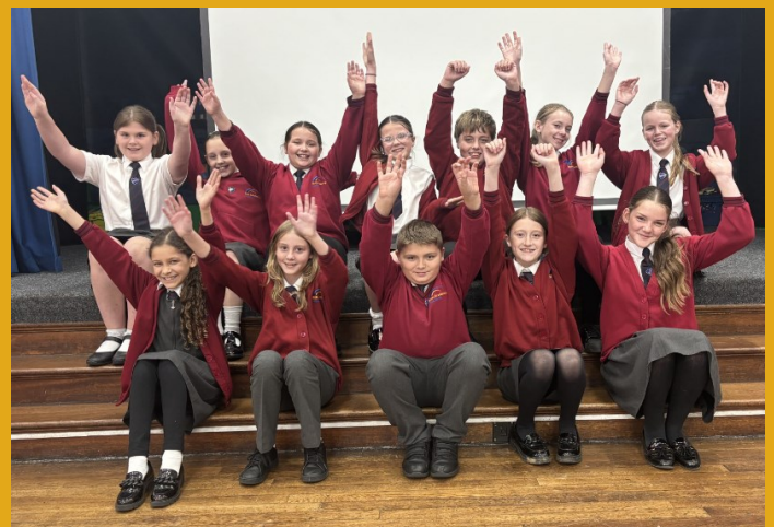
Our wonderful Prefects!