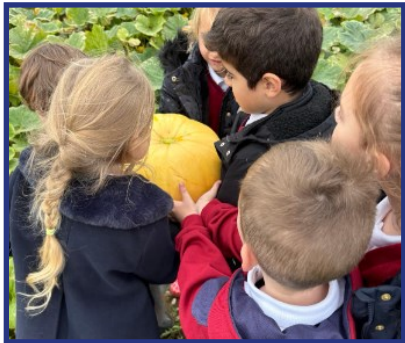
Such a big pumpkin!