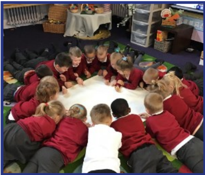
Team work in the Early Years!