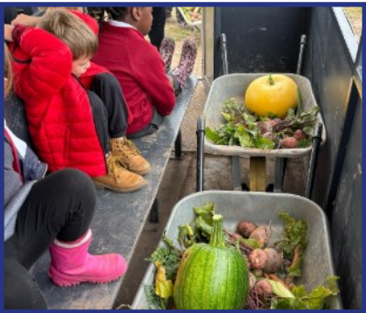
Picking vegetables with Year 2