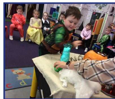
More of our Halloween theme day.