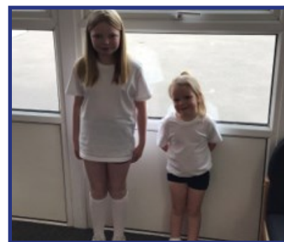
Look how smart the children are at showing our Sun Academy Way.